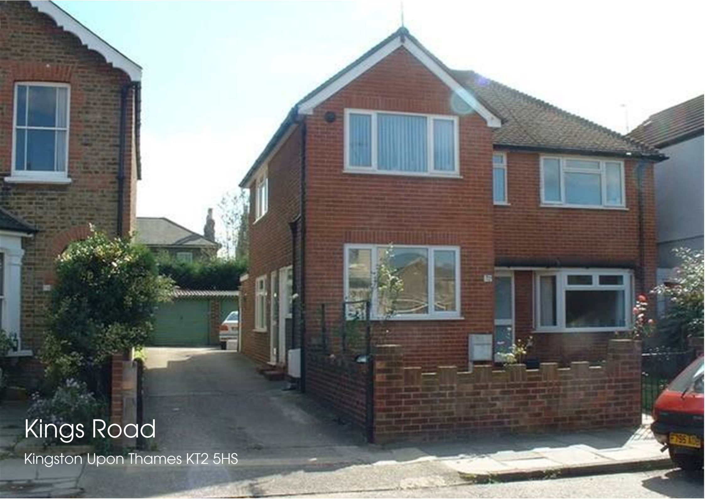
Kings Road Kingston Upon Thames KT2 5HS